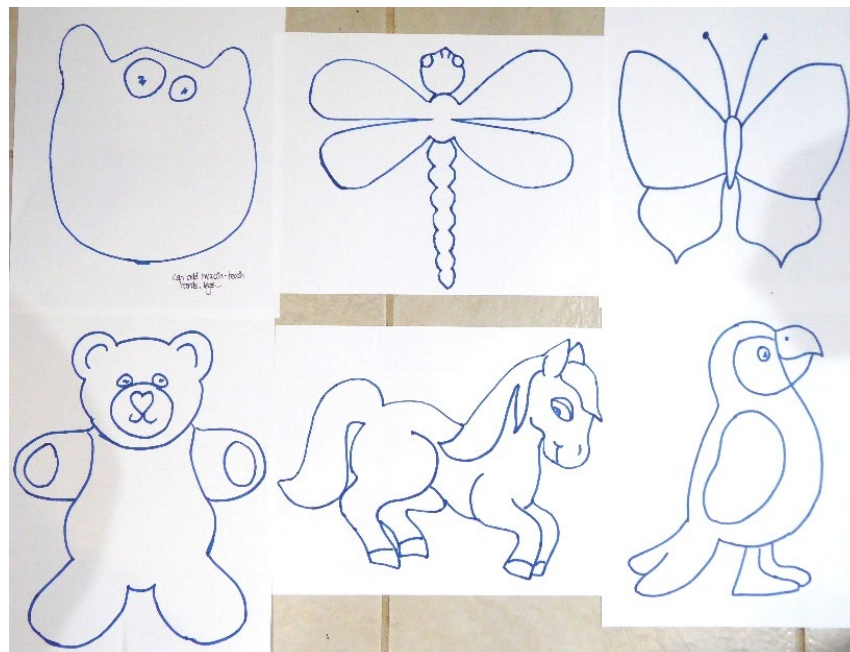
More complex designs